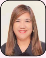
Hon. Josefina E. Siscar, Presiding Judge Regional Trial Court of Manila Branch 55

The onslaught of COVID 19 has brought the world to its knees. The effects are damaging, incessant, and continuous. All aspects of the economy, the government, private institutions, jobs, schools, churches were all seriously affected.