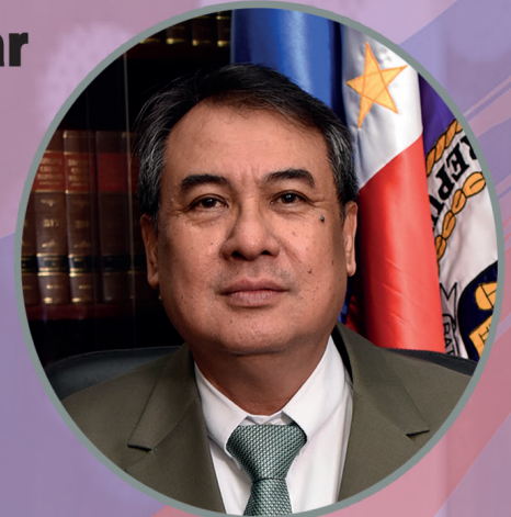
Chief Justice Alexander Gesmundo

Chief Justice of the Supreme Court of the Philippines